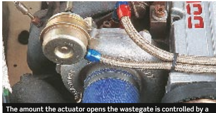
pressure input (above) direct from (in this case) the Amal valve