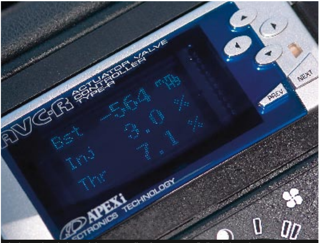
Dig the new breed: electronic boost controllers from Japan are finding their way into more and more big-power Fords. Tricky and expensive to fit, maybe, but they're the future for accurate boost control