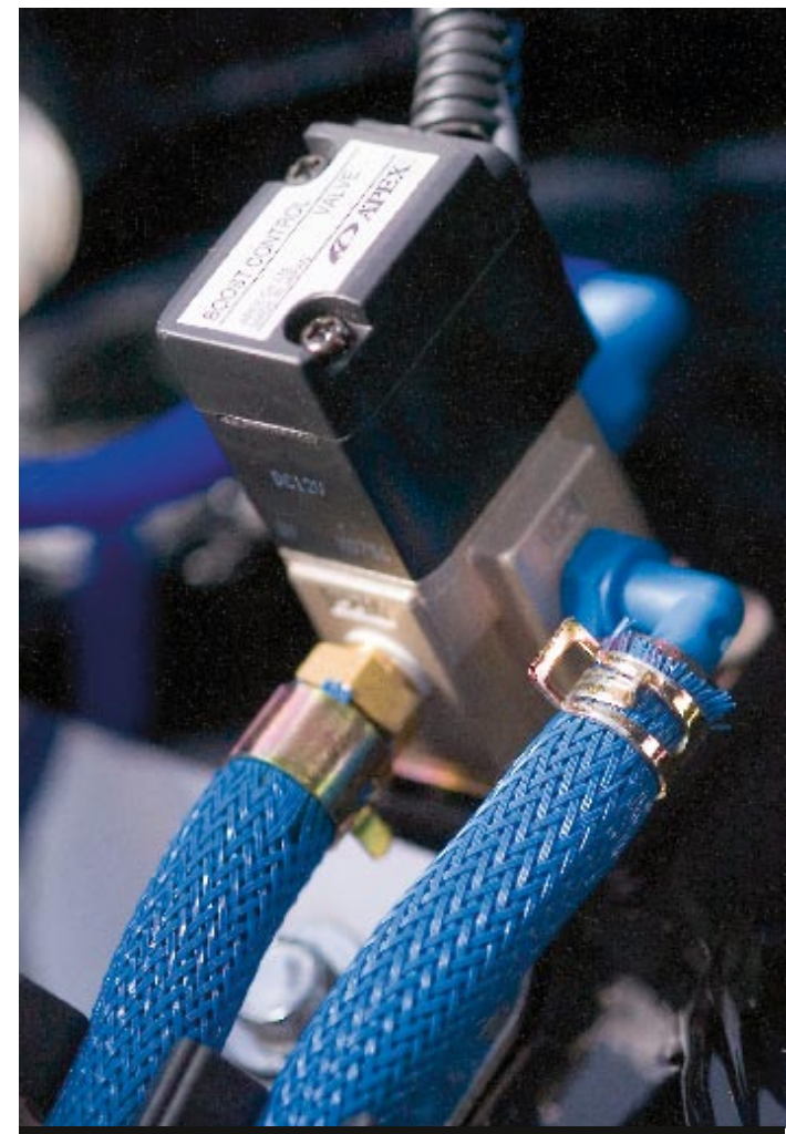
Electronic boost controllers (below) use one or two solenoids rather than injectors to control bleed off of boost pressure

Spark advance: just what the hell is it, and why do we need it? Stu explains all in the next issue