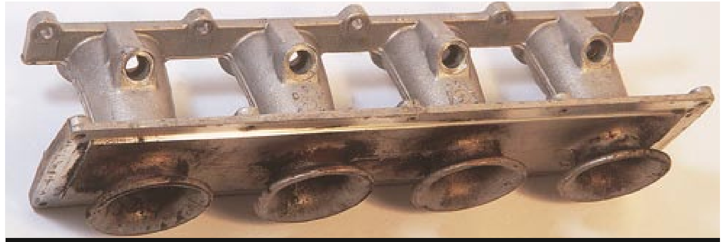
Inside the Cosworth YB plenum (top pic) you'll find these four inlets. It's the air pressure going into these that the fuel regulator needs to monitor before it can distribute fuel at high pressure into those four holes on the inlet manifold via the injectors

Now let's imagine we have measured your lung capacity and know it to be exactly 2 psi, so you blow the water out into the glass and it takes you 10 seconds to do so. With no resistance at the end of the straw you blew the water out very easily, as you would expect. Now try and imagine that exercise mimicked a fuel injector that was injecting fuel into the cylinder of an engine that was turned off. No real