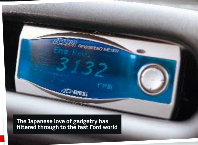
The Japanese love of gadgetry has filtered through to the fast Ford world

position as top dog, it's done more good than harm, giving us such delights as electronic boost controllers and advanced engine management systems. Plus, as the saying goes, competition improves the breed.