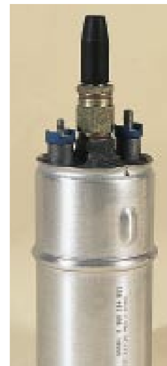
Electric fuel pumps can fire out fuel at a massive 9 bar...

pressure brings about its own pitfalls, so let's go back to basics and see if I can explain it using some easy to understand terminology.