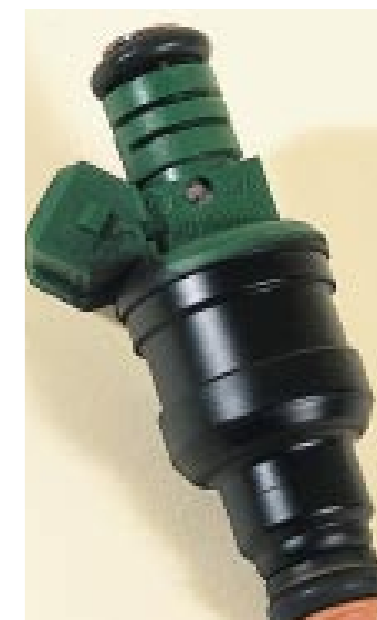
Fuel injectors are simply valves controlled by the ECU

Why do we actually need to be under such high pressure? OK, that's a good question, and the answer lies at the all important fuel injectors. The fuel injectors on most EFI systems are simply solenoid valves that are capable of both handling fuel in a harsh unforgiving