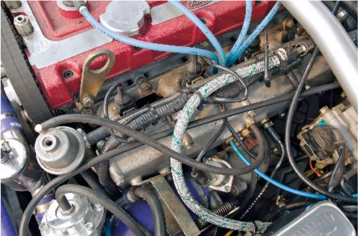
Fuel pressure regulator is the pork pie hat-shaped canister halfway up the left-hand side of this pic. The top pipe connects to the plenum chamber and relays a pressure signal back to the spring and diaphragm inside the regulator to determine the fuel pressure supplied

chosen dictates the fuel pressure required and the system is designed from here upwards. Most commonly, these pressures are in the 3-4 bar range.