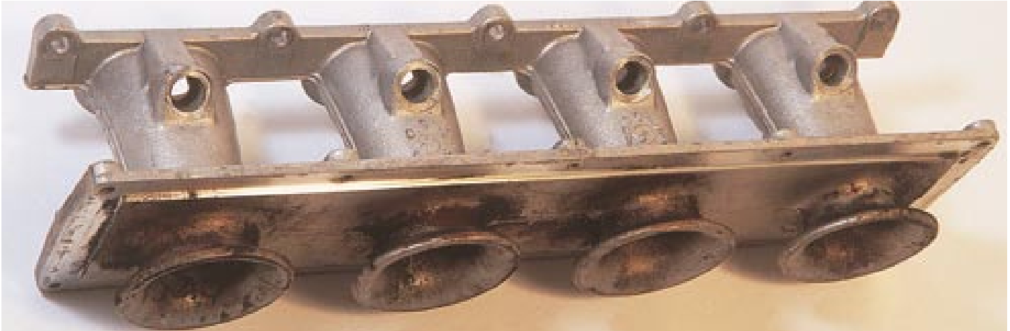
Inside the Cosworth YB plenum (top pic) you'll find these four inlets. It's the air pressure going into these that the fuel regulator needs to monitor before it can distribute fuel at high pressure into those four holes on the inlet manifold via the injectors

Now let's imagine we have measured your lung capacity and know it to be exactly 2 psi, so you blow the water out into the glass and it takes you 10 seconds to do so. With no resistance at the end of the straw you blew the water out very easily, as you would expect. Now try and imagine that exercise mimicked a fuel injector that was injecting fuel into the cylinder of an engine that was turned off. No real